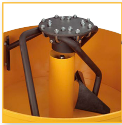
Mixer arms, complete set incl. rubber blades, top disc, U-bolts Item no. 300 024