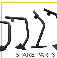
Mixer arms wo/top disc, wo/rubber blades Item no. 200 024B