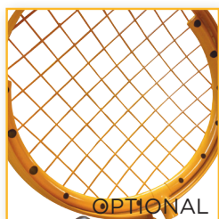
Dust Control Item no. 200 001DL