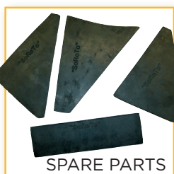
Mixer blades, rubber, Item no. 200 024R